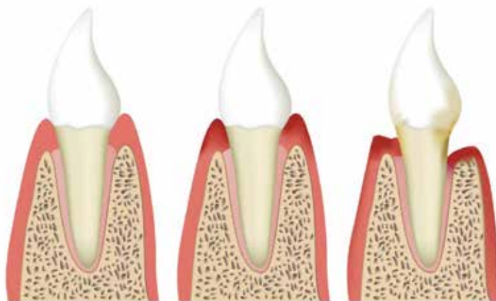
Healthy tooth → Gingivitis (gum infection) → Parodontitis with gum

Above: the progression from healthy teeth and gums to gums with pronounced recession. The most common cause of receding gums, also known as gingival recession, is gum disease. Addressing the issue starts with prevention.